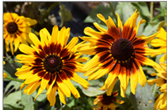
Denver Daisy Coneflower flowers