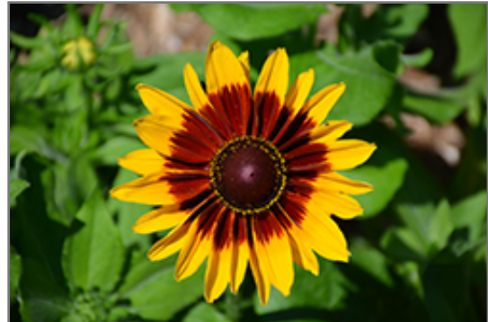
Denver Daisy Coneflower flowers

Denver Daisy Coneflower is an herbaceous perennial with an upright spreading habit of growth. Its medium texture blends into the garden, but can always be balanced by a couple of finer or coarser plants for an effective composition.