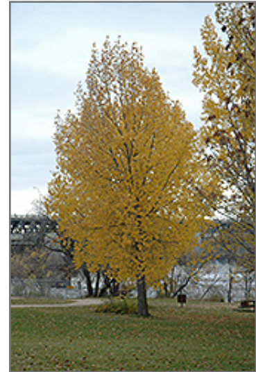
Siouxland Poplar in fall