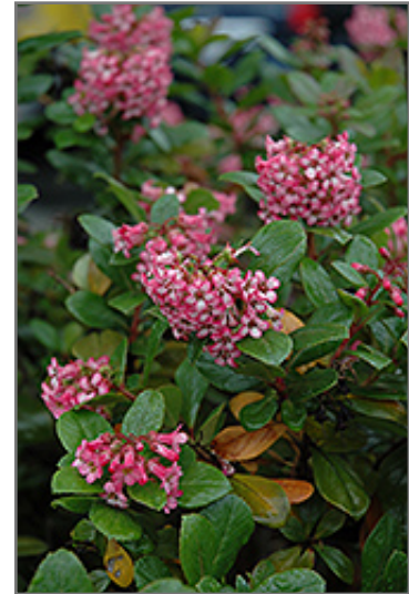
Newport Dwarf Escallonia flowers

Newport Dwarf Escallonia is recommended for the following landscape applications;