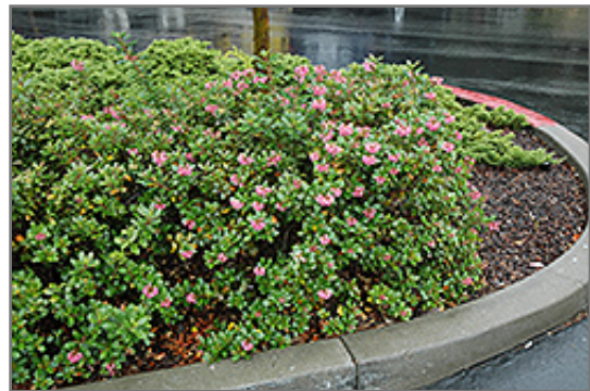
Newport Dwarf Escallonia in bloom