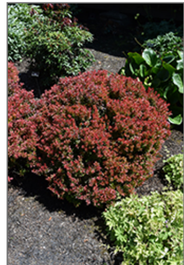
Golden Ruby Barberry