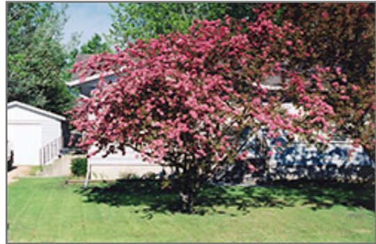
Almey Flowering Crab in bloom