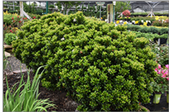
Dwarf Yeddo Hawthorn

Dwarf Yeddo Hawthorn is recommended for the following landscape applications;