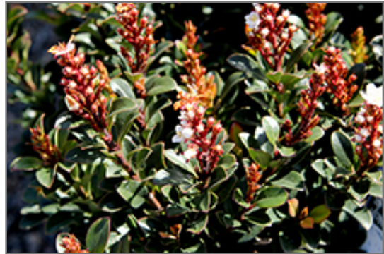
Dwarf Yeddo Hawthorn flowers

This shrub does best in full sun to partial shade. It prefers to grow in average to moist conditions, and shouldn't be allowed to dry out. It is not particular as to soil type or pH. It is somewhat tolerant of urban pollution. This is a selected variety of a species not originally from North America.