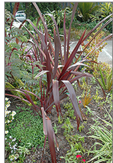
Amazing Red New Zealand Flax foliage