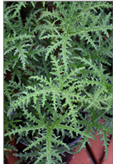
Pine Scented Geranium foliage