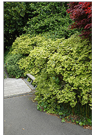
White-Flowered Chinese Fringeflower