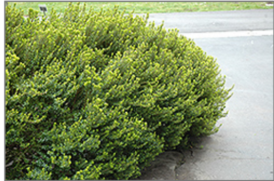
Dwarf Myrtle

Dwarf Myrtle is recommended for the following landscape applications;