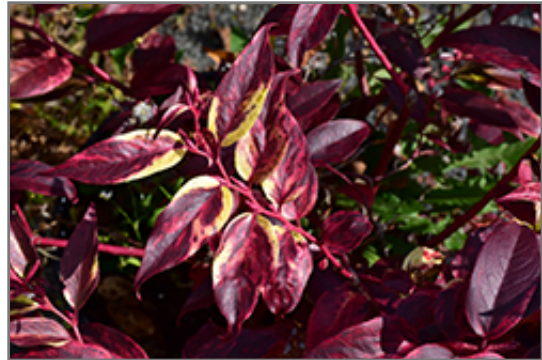
Rainbow Fetterbush in fall

Rainbow Fetterbush makes a fine choice for the outdoor landscape, but it is also well-suited for use in outdoor pots and containers. Because of its height, it is often used as a 'thriller' in the 'spiller-thriller-filler' container combination; plant it near the center of the pot, surrounded by smaller plants and those that spill over the edges. It is even sizeable enough that it can be grown alone in a suitable container. Note that when grown in a container, it may not perform exactly as indicated on the tag - this is to be expected. Also note that when growing plants in outdoor containers and baskets, they may require more frequent waterings than they would in the yard or garden.