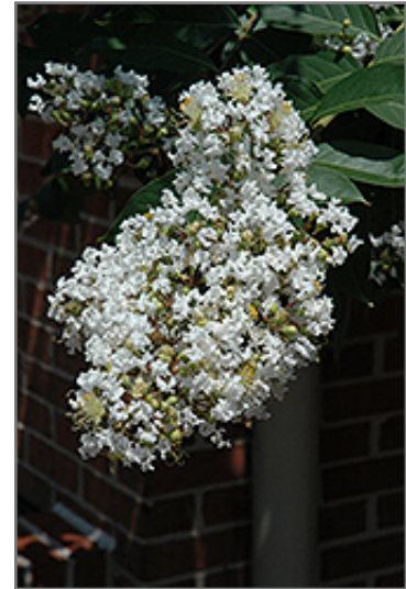
Natchez Crapemyrtle flowers

This is a relatively low maintenance tree, and is best pruned in late winter once the threat of extreme cold has passed. Deer don't particularly care for this plant and will usually leave it alone in favor of tastier treats. It has no significant negative characteristics.