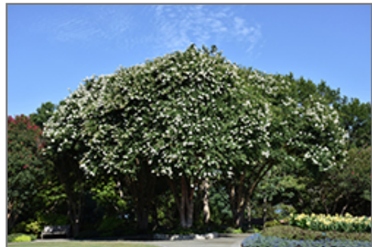
Natchez Crapemyrtle in bloom