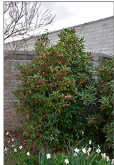
Woodland Ruby Anise Tree in bloom