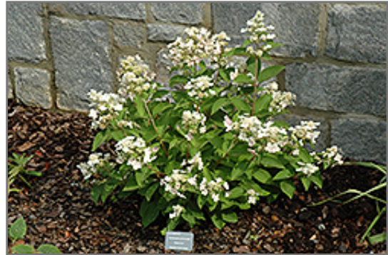
Dharuma Hydrangea in bloom

This shrub does best in full sun to partial shade. It prefers to grow in average to moist conditions, and shouldn't be allowed to dry out. It is not particular as to soil type, but has a definite preference for acidic soils. It is highly tolerant of urban pollution and will even thrive in inner city environments. Consider applying a thick mulch around the root zone in winter to protect it in exposed locations or colder microclimates. This is a selected variety of a species not originally from North America.