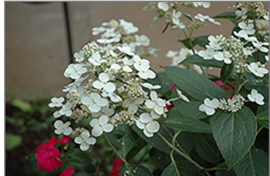
Dharuma Hydrangea flowers