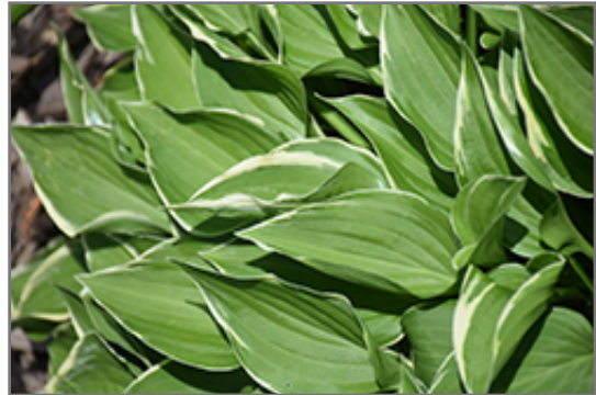
Cheesecake Hosta

Cheesecake Hosta is recommended for the following landscape applications;