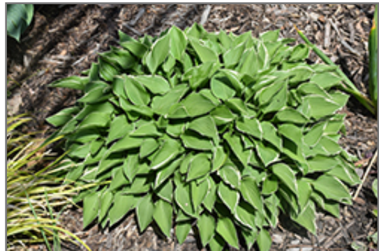
Cheesecake Hosta