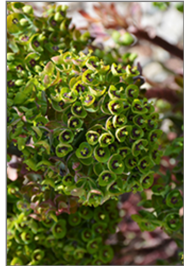
Tiny Tim Spurge flowers

Tiny Tim Spurge is a fine choice for the garden, but it is also a good selection for planting in outdoor pots and containers. It is often used as a 'filler' in the 'spiller-thriller-filler' container combination, providing a mass of flowers against which the thriller plants stand out. Note that when growing plants in outdoor containers and baskets, they may require more frequent waterings than they would in the yard or garden.