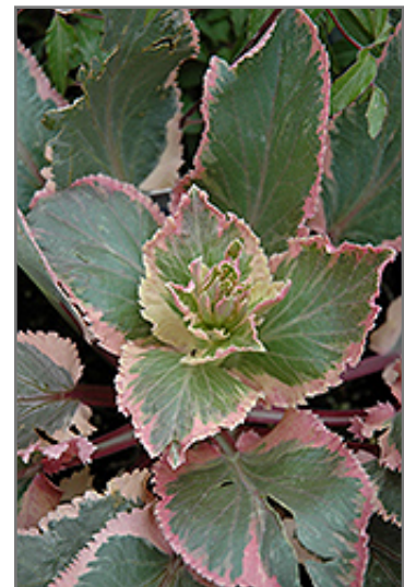
Jade Frost Variegated Sea Holly foliage