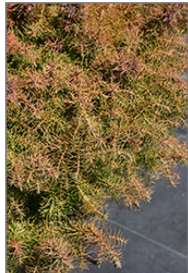
Mushroom Japanese Cedar foliage