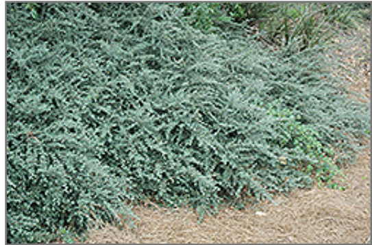
Gray Leaf Cotoneaster

This shrub does best in full sun to partial shade. It is very adaptable to both dry and moist growing conditions, but will not tolerate any standing water. It is not particular as to soil pH, but grows best in rich soils, and is able to handle environmental salt. It is highly tolerant of urban pollution and will even thrive in inner city environments. This species is not originally from North America.