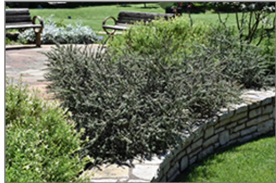
Gray Leaf Cotoneaster