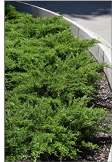
Broadmoor Juniper