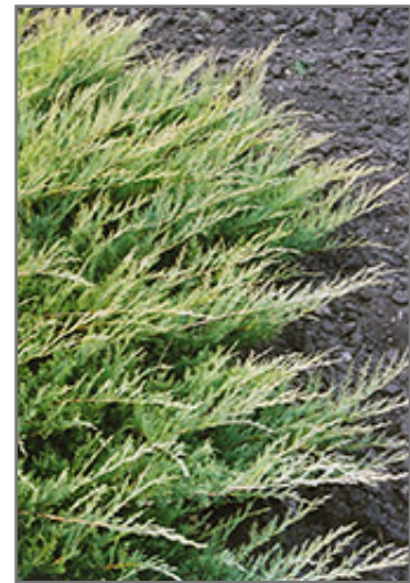
Broadmoor Juniper foliage