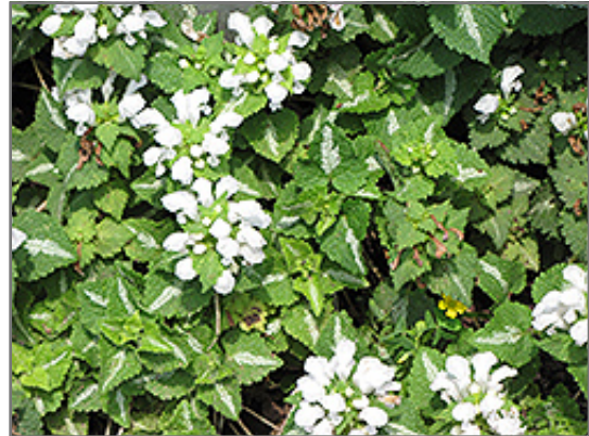
White Spotted Dead Nettle flowers