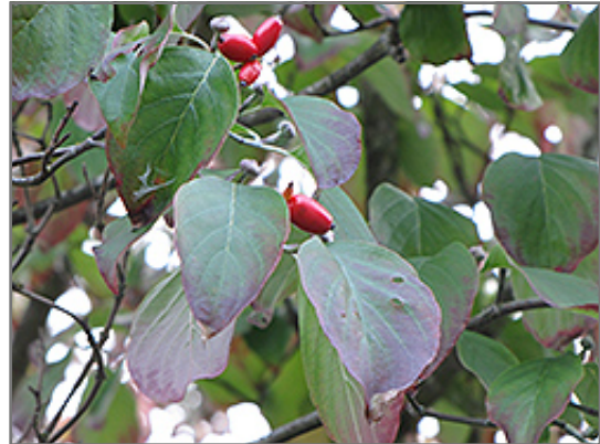
Cherokee Chief Flowering Dogwood fruit

This tree does best in full sun to partial shade. You may want to keep it away from hot, dry locations that receive direct afternoon sun or which get reflected sunlight, such as against the south side of a white wall. It requires an evenly moist well-drained soil for optimal growth, but will die in standing water. It is very fussy about its soil conditions and must have rich, acidic soils to ensure success, and is subject to chlorosis (yellowing) of the foliage in alkaline soils. It is quite intolerant of urban pollution, therefore inner city or urban streetside plantings are best avoided, and will benefit from being planted in a relatively sheltered location. Consider applying a thick mulch around the root zone in winter to protect it in exposed locations or colder microclimates. This is a selection of a native North American species.