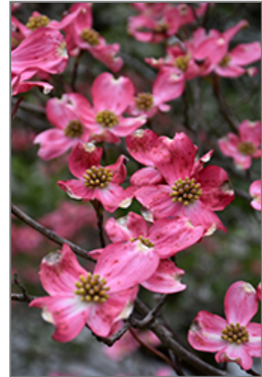
Cherokee Chief Flowering Dogwood flowers

This is a relatively low maintenance tree, and usually looks its best without pruning, although it will tolerate pruning. It is a good choice for attracting birds to your yard. Gardeners should be aware of the following characteristic(s) that may warrant special consideration;