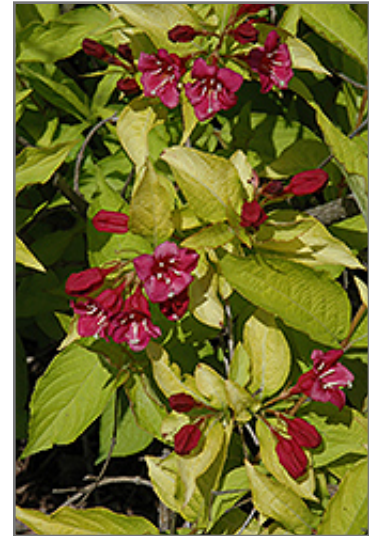
Rubidor Weigela flowers

Rubidor Weigela is recommended for the following landscape applications;