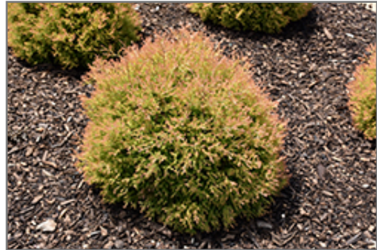
Fire Chief Arborvitae

Fire Chief Arborvitae is recommended for the following landscape applications;