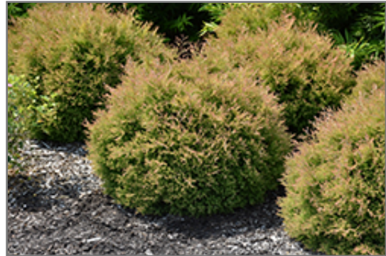
Fire Chief Arborvitae

This shrub does best in full sun to partial shade. It prefers to grow in average to moist conditions, and shouldn't be allowed to dry out. It is not particular as to soil type or pH. It is somewhat tolerant of urban pollution, and will benefit from being planted in a relatively sheltered location. Consider applying a thick mulch around the root zone in winter to protect it in exposed locations or colder microclimates. This is a selection of a native North American species.