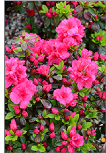
Jeremiah Azalea flowers