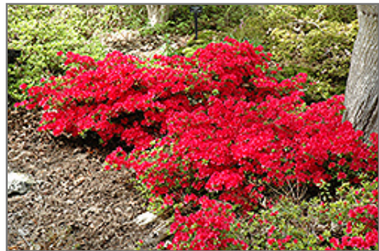
Hino Crimson Azalea in bloom