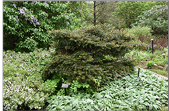
Blue Mesa Blue Spruce

Blue Mesa Blue Spruce is recommended for the following landscape applications;