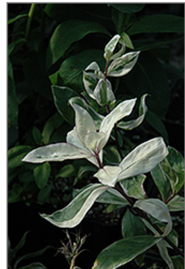
Montrose Tricolor Phlox foliage