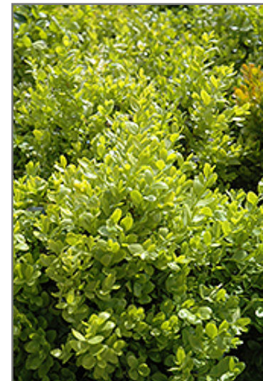
Dwarf English Boxwood foliage