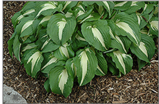
Night Before Christmas Hosta foliage

Night Before Christmas Hosta is recommended for the following landscape applications;