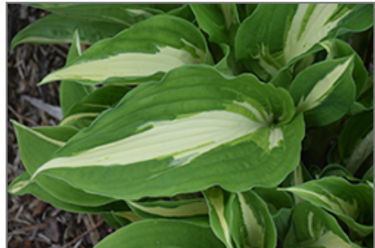
Night Before Christmas Hosta foliage