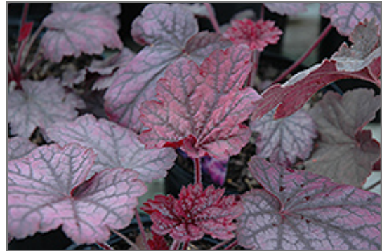
Midnight Bayou Coral Bells foliage

Midnight Bayou Coral Bells is recommended for the following landscape applications;