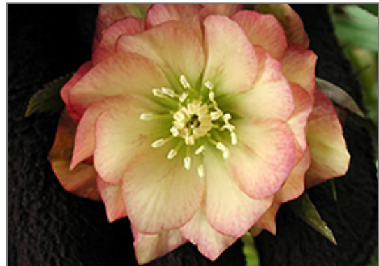
Amber Gem Hellebore flowers