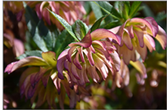
Amber Gem Hellebore flowers

Amber Gem Hellebore is recommended for the following landscape applications;