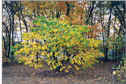
Northern Strain Redbud in fall

Northern Strain Redbud will grow to be about 25 feet tall at maturity, with a spread of 30 feet. It has a low canopy with a typical clearance of 3 feet from the ground, and is suitable for planting under power lines. It grows at a medium rate, and under ideal conditions can be expected to live for 60 years or more.