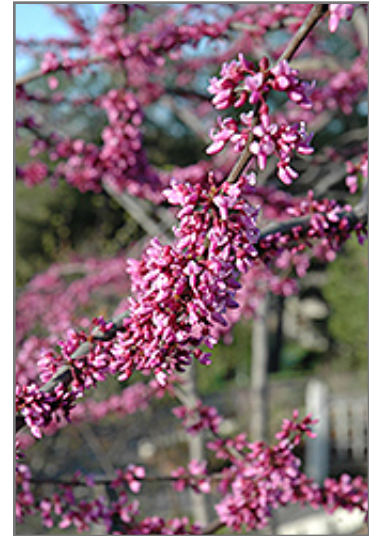
Northern Strain Redbud flowers