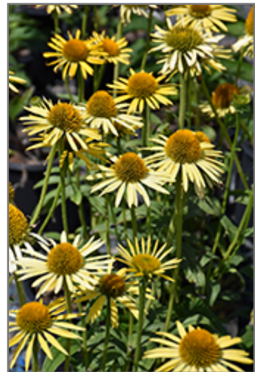
Maui Sunshine Coneflower flowers