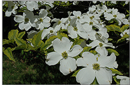
Rainbow Flowering Dogwood flowers

This is a relatively low maintenance tree, and should only be pruned after flowering to avoid removing any of the current season's flowers. It is a good choice for attracting birds to your yard. Gardeners should be aware of the following characteristic(s) that may warrant special consideration;