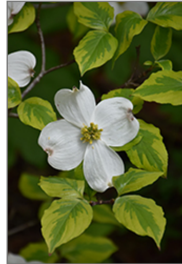
Rainbow Flowering Dogwood flowers

This tree does best in full sun to partial shade. You may want to keep it away from hot, dry locations that receive direct afternoon sun or which get reflected sunlight, such as against the south side of a white wall. It requires an evenly moist well-drained soil for optimal growth, but will die in standing water. It is very fussy about its soil conditions and must have rich, acidic soils to ensure success, and is subject to chlorosis (yellowing) of the foliage in alkaline soils. It is quite intolerant of urban pollution, therefore inner city or urban streetside plantings are best avoided, and will benefit from being planted in a relatively sheltered location. Consider applying a thick mulch around the root zone in winter to protect it in exposed locations or colder microclimates. This is a selection of a native North American species.