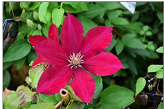
Rebecca Clematis flowers