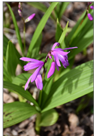
Lavender Japanese Hyacinth Orchid flowers