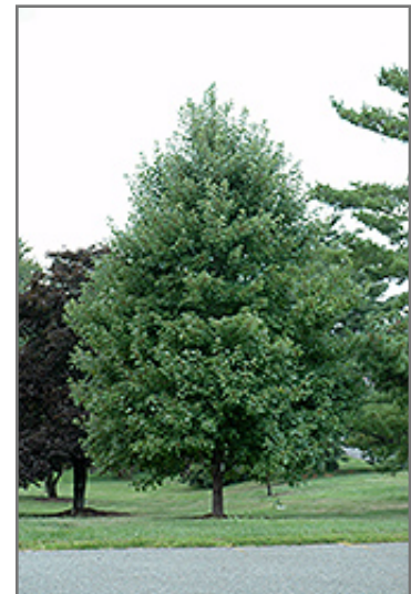
October Glory Red Maple