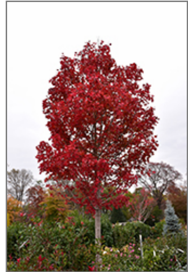
October Glory Red Maple in fall