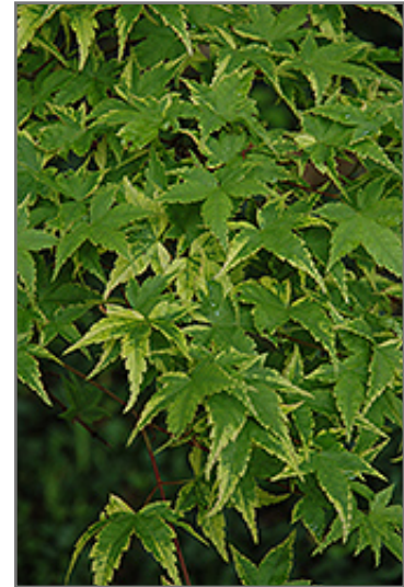
Sagara Nishiki Japanese Maple foliage

Sagara Nishiki Japanese Maple is recommended for the following landscape applications;