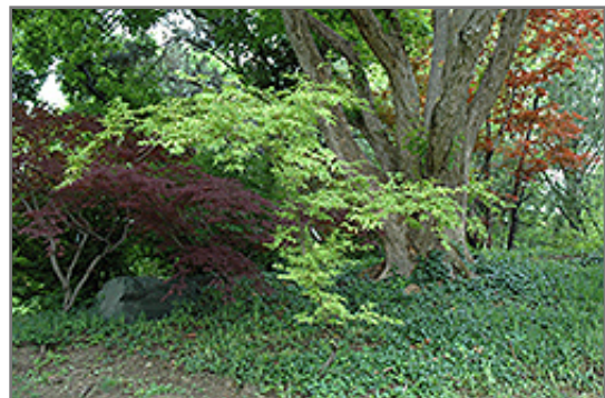
Sagara Nishiki Japanese Maple