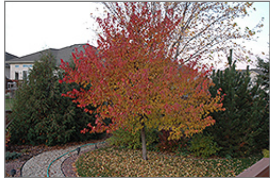
Embers Amur Maple in fall