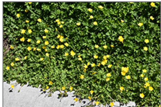
Barren Strawberry in bloom