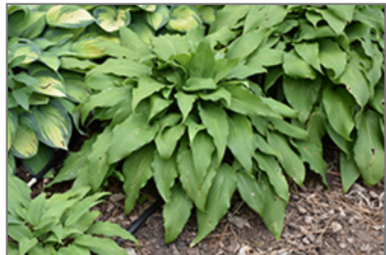
Red October Hosta