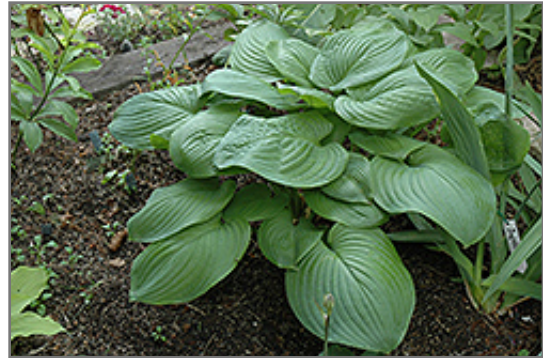
Fried Green Tomatoes Hosta