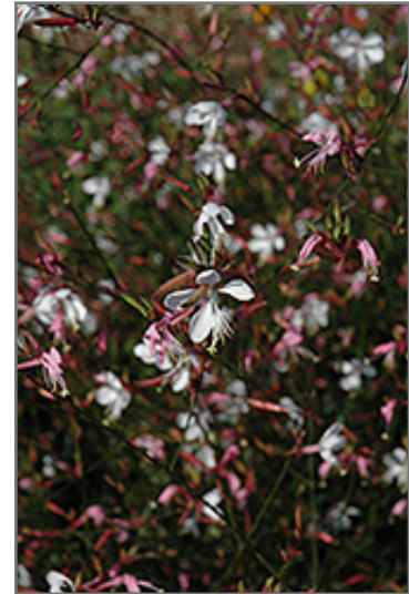
Snowstorm Gaura flowers

Snowstorm Gaura is recommended for the following landscape applications;