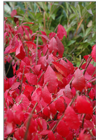
Burning Bush (tree form) in fall