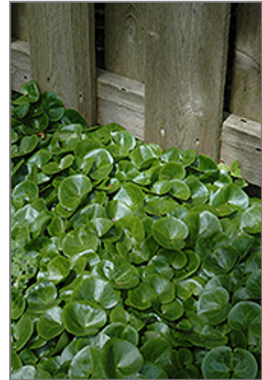
European Wild Ginger