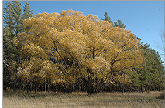
White Willow in fall