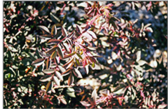
Red Leaf Rose foliage

This shrub should only be grown in full sunlight. It does best in average to evenly moist conditions, but will not tolerate standing water. It is not particular as to soil type or pH. It is highly tolerant of urban pollution and will even thrive in inner city environments. This species is not originally from North America.