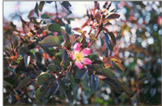
Red Leaf Rose flowers

This is a high maintenance shrub that will require regular care and upkeep, and is best pruned in late winter once the threat of extreme cold has passed. It is a good choice for attracting bees to your yard. Gardeners should be aware of the following characteristic(s) that may warrant special consideration;