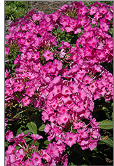
Flame Pink Garden Phlox flowers