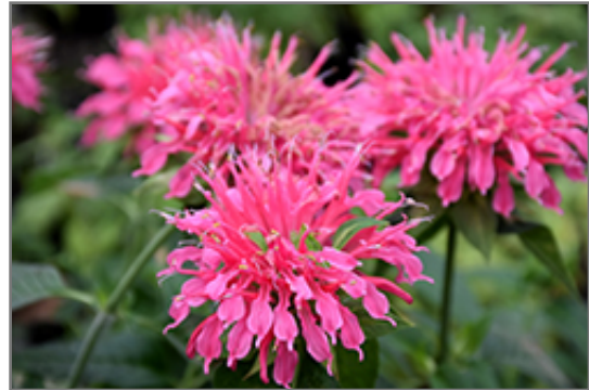
Coral Reef Beebalm flowers

Coral Reef Beebalm is recommended for the following landscape applications;